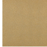
Jazz Gold - 29